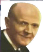
Rtn. Paul Harris Founder