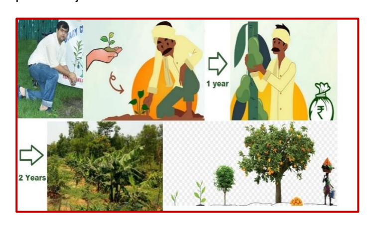
In this Project we plan to plant: 30 * 41 (Members) = 1230 Plants

When All farmers start to give Organic Fruits, It would be financially rewarding to Farmers and Ourselves as we will get healthy Fruits without chemical. Even Grazing fields for the cows would increase. This initiative would hence also cater to Healthy Cows. Trees to help Increase Water Table + Environment which is our prime Objective.