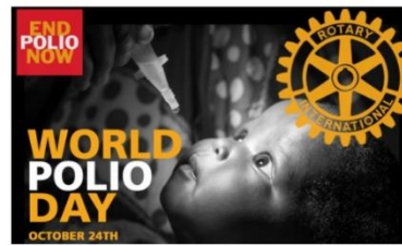
Rotary Club of Calcutta Inner City

Hand sanitizer, mask, soap and light refreshments to the Health Workers were provided