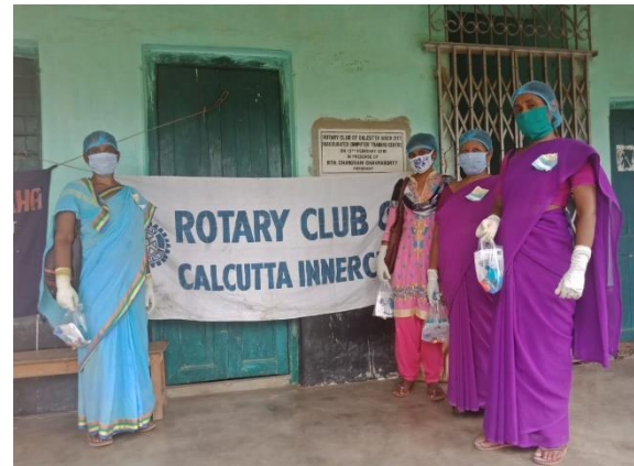
Rotary Club of Calcutta Inner City