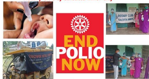
RCC Ranjapur Mitali Sangha