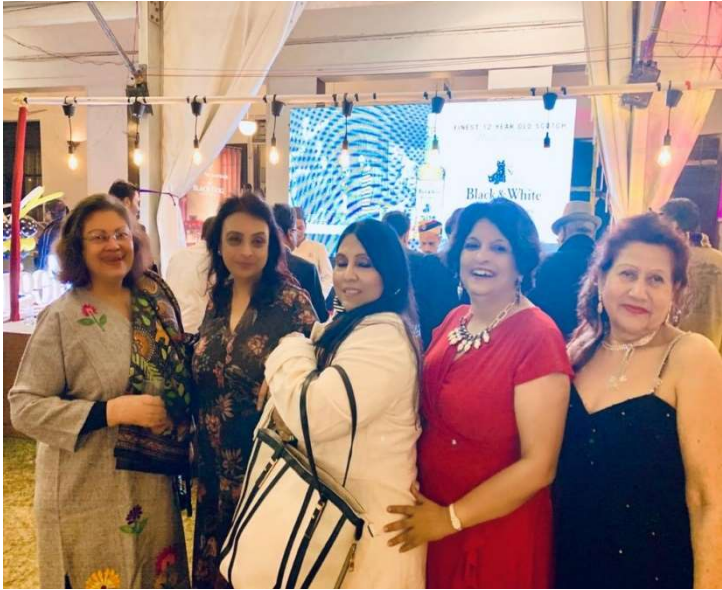
Our Inner City Members 7 Spouses enjoying 31 st December 2019 party at Calcutta Club .