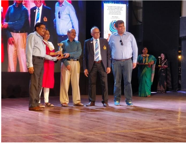
RC INNER CITY TEAM RECEIVING AWARDS