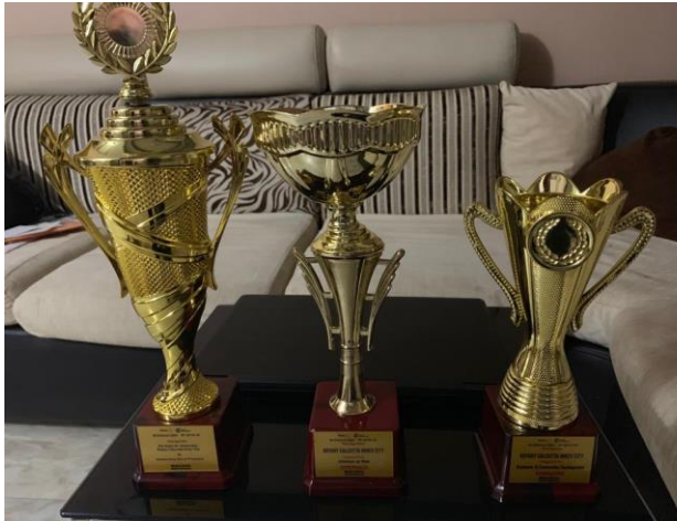
OUTSTANDING PRESIDENT; CHILDREN AT RISK; 1 ST IN ECONOMIC & COMMUNITY DEVELOPMENT