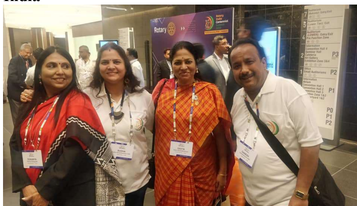
Rotarian and members from other Districts in India