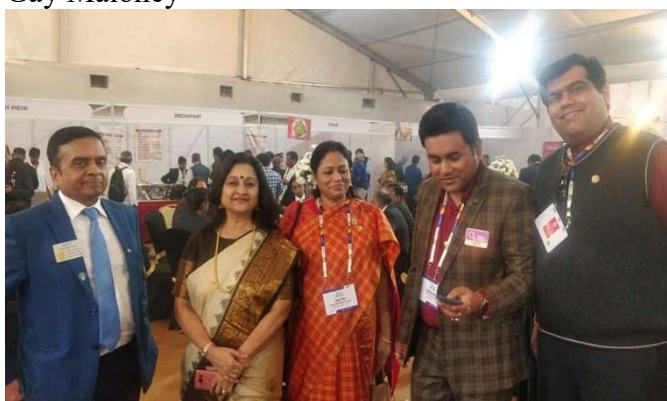
District Governor 3291 and Inner-City Club members