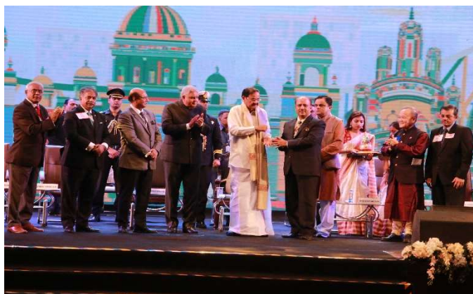
Governor of West Bengal and Vice President of India