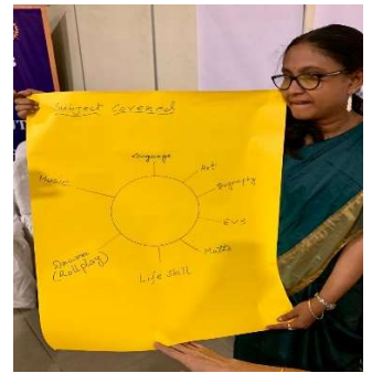
Visual Art created by trainees