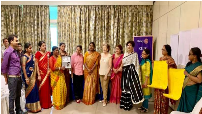
Group activity of the teachers