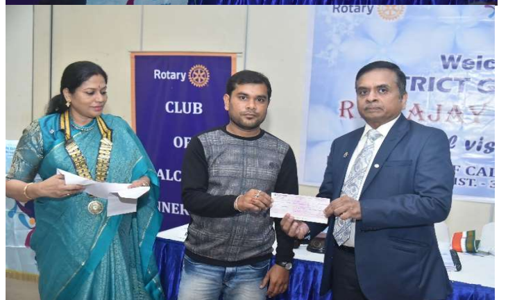
Teachers salary being distributed to all three RCC.