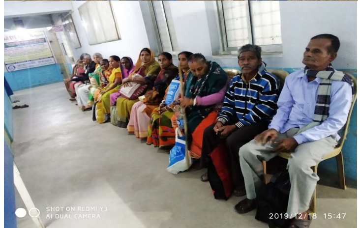
Project Jyoti:-An Eye Operation done for 21 patients from RCC Ranjapur