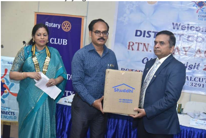
Water Filter provided to RCC Tanjapur, Usthi and Dearea